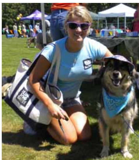
Blue bandanna for a Blue Dog!

So far our treats on the street program has been wildly fun and successful. We have been handing out treat packs and coupons at Seattle/Tacoma dog parks, neighborhood markets and events all around the Seattle/Tacoma metro area. If you haven't seen us yet, the summer isn't over. You can find out where we will be on our website and Facebook page. Here are some of our favorite photos from the parks: