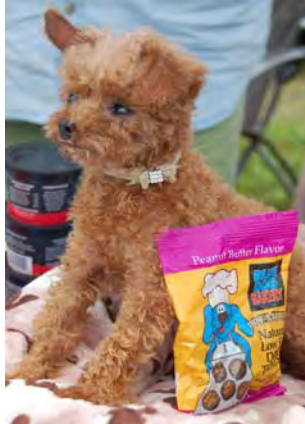
Whisker Walk Lancaster, MA 6/6/2010 Benefiting various shelters and rescues