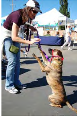
A Cause for Paws Boulder, CO 9/11/2010 Benefiting the Humane Society of Boulder Valley