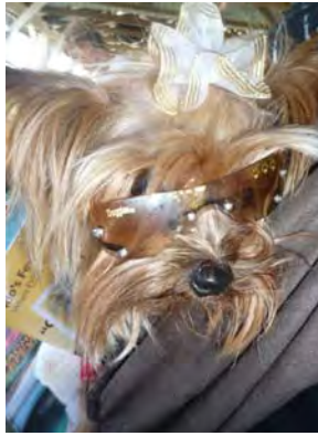
Fido's Fest Woodstown, NJ 10/9-10/10/2010