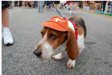
The Mighty Texas Dog Walk Austin, TX 4/17/2010 Benefiting Texas Hearing and Service Dogs

As the weather get chillier (in most states), events start winding down and our Community Calendar feels relatively bare. To wrap up 2010, a year of much traveling by Blue Dog Bakery to so many fun events, I thought it would be fun to recap with our favorite photos.