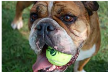
The Race for the Rescues Pasadena, CA 10/24/2010 Benefiting The Rescue Train

Looking forward to 2011 and many more events to come!